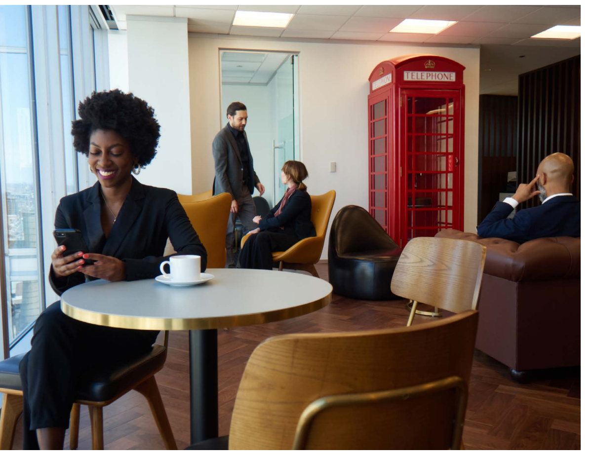
Riverpoint // Chicago