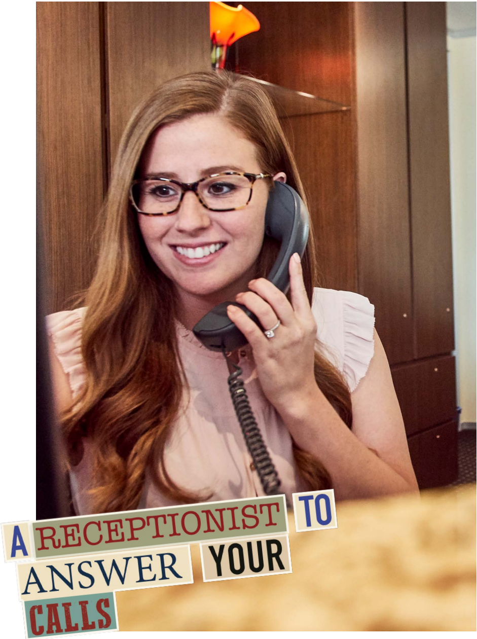
One World Trade Centre // New York