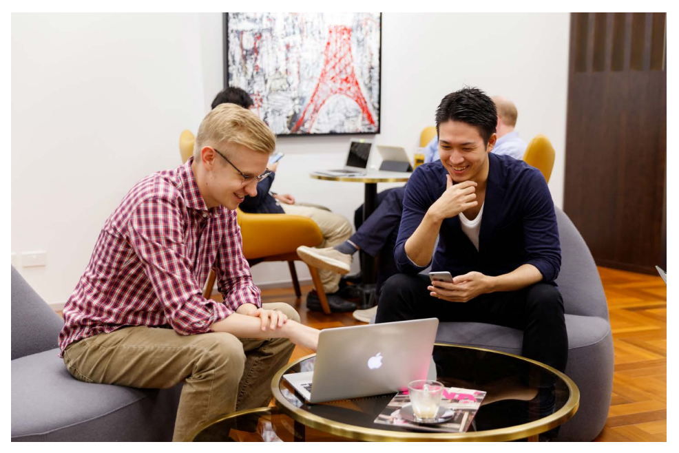
Tri-Seven Roppongi // Tokyo

Your Servcorp Team can arrange for your Servcorp telephone number and business directory listing to be displayed in local telephone and online directories, increasing your business's visibility in the global market.